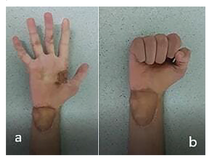
Figure 2. View of the right hand in active extension (a) and flexion (b) after treatment

mn: Median nerve, fds: Flexor digitorum superficialis, fdp: Flexor digitorum profundus