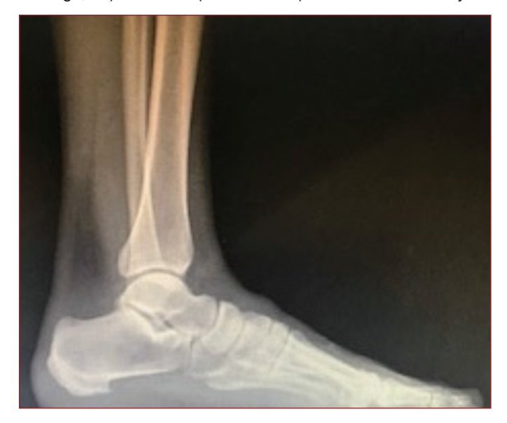
Figure 1. Plantar heel spur of a patient shown on radiograph

Statistical Package for the Social Sciences (SPSS, Inc., Chicago, IL) software (version 15.0) was used for analysis.