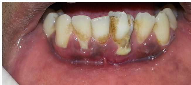
Figure 1: Labial aspect of rotated geminated mandibular left incisor