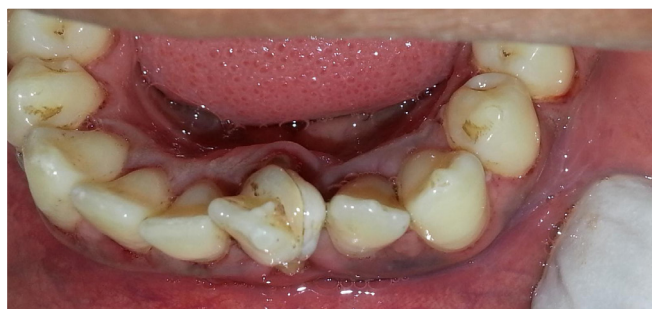
Figure 2: Incisal aspect of geminated mandibular left incisor with Talon's cusp

A 24 year old male patient reported to the Department of Oral Medicine and Radiology with the complaint of deposits in all teeth since six months with no associated symptoms. The patient was well built and nourished. On intra oral examination, the gingiva was marginally inflamed along with recession on mandibular left central incisor and mandibular right lateral incisor. Stains were also noted on all teeth. The tooth number 31 was conjoined with partially separated crowns and slightly rotated on the labial aspect [Figure 1].