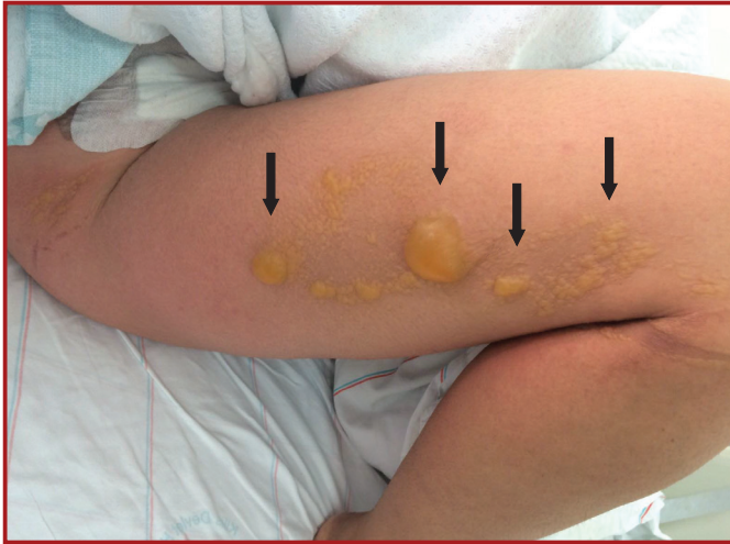
Figure 2. Typical blister formations due to SM contact on the right lower extremity of Patient 2 on 18th h after the exposure.