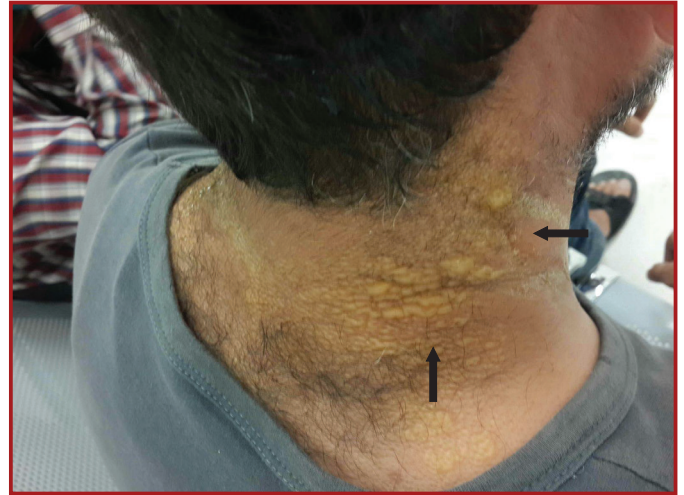
Figure 4. Typical blister formations due to SM contact on the neck of Patient 1 on 18th h after the exposure.