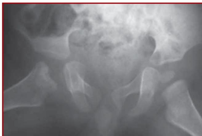
Figure 2. Six weeks after the operation, radiograph of the pelvis demonstrates deformed proximal femoral metaphysis and no visible femoral head on the right. Note the right hip is reduced

second cast with the hip 45^\circ of flexion and abduction was applied with the knees out of the cast. The second cast was held for four weeks and then removed in the clinic. Radiographs of the pelvis showed a destruction of the femoral neck and a difficultly visible ossified small femoral head. Physical examination revealed a stable hip. We did not apply any kind of immobilization after this point and the child was called for routine controls. He began walking independently at the age of 12 months. The last control was made at the post-operative 12 month. Physical examination showed full range of motion of the affected hip with similar foot progression and thigh-foot angles on both sides. The child was active without any restriction of movements except for only slightly noticeable waddling during walking and running. Radiographs showed an ossified femoral head on a short femoral neck and mild acetabular dysplasia (Figure 3). Radiographic appearance made us to classify the condition as the Choi Type IIA hip septic arthritis sequela (2,3,7). At this point observation with follow-up visits was decided.