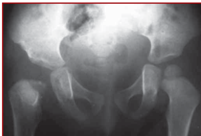
Figure 3. At the last follow-up visit 12 months after the operation, radiograph of the pelvis demonstrates a reduced, reossified and deformed femoral head, short but remodeled femoral neck, and mild acetabular dysplasia on the right side (Choi type IIA sequela)

second cast with the hip 45^\circ of flexion and abduction was applied with the knees out of the cast. The second cast was held for four weeks and then removed in the clinic. Radiographs of the pelvis showed a destruction of the femoral neck and a difficultly visible ossified small femoral head. Physical examination revealed a stable hip. We did not apply any kind of immobilization after this point and the child was called for routine controls. He began walking independently at the age of 12 months. The last control was made at the post-operative 12 month. Physical examination showed full range of motion of the affected hip with similar foot progression and thigh-foot angles on both sides. The child was active without any restriction of movements except for only slightly noticeable waddling during walking and running. Radiographs showed an ossified femoral head on a short femoral neck and mild acetabular dysplasia (Figure 3). Radiographic appearance made us to classify the condition as the Choi Type IIA hip septic arthritis sequela (2,3,7). At this point observation with follow-up visits was decided.