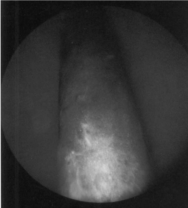
Figure 2. Cystoscopic view of the piece of pen